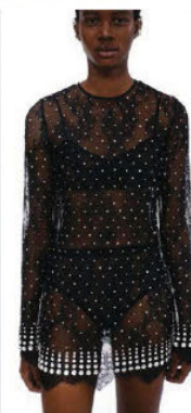
Chb, spring 2023