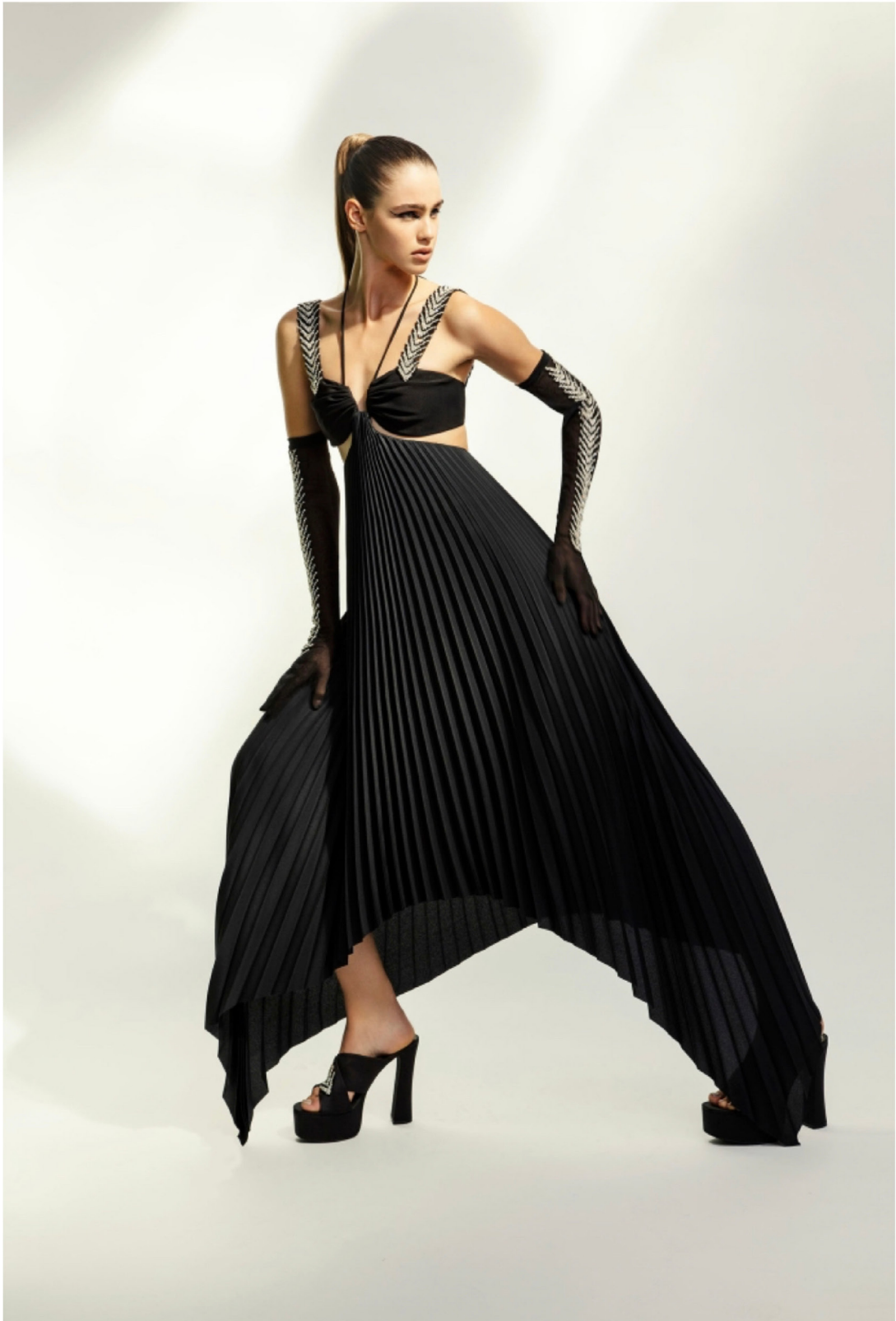
Balestra RTW Spring 2023