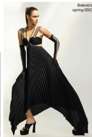
Balestra, spring 2023