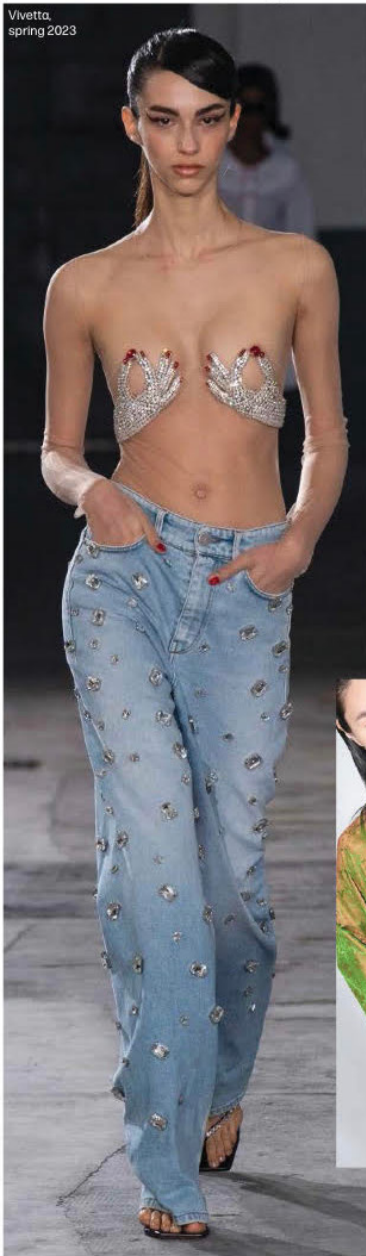
Vivetta, spring 2023

Rizza offered day-to-night attire befitting city girls and boys always up for a last-minute party invite. He did so by channeling a refined attitude that also had a sensual touch, as in see-through midi skirts covered in rich blooming twigs or lacey crop tops, and with urban gear — loose jeans and pocketed overshirts subtly dotted in crystals.