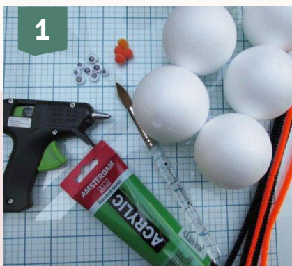
1 Using glue gun or Styrofoam glue, glue 6 balls in the form of your caterpillar.

Using various sizes of Styrofoam balls, some chenille wires and glue you can create the cutest of caterpillars! Paint these creepy crawlies in your favourite colours and give them their own personalities by adding funny googly eyes. Fun to craft with children and great for brightening up the garden or nursery.