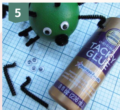
5 Finish off your Caterpillar using a little blob craft glue to attach the eyes and nose.