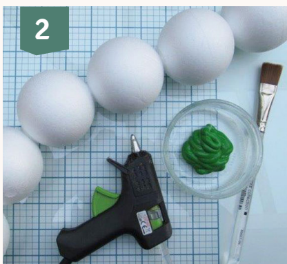
2 Let the glue dry and then paint your caterpillar in a colour of your choice.