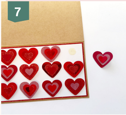
Now, take the layered hearts and affix them to the glue dots.