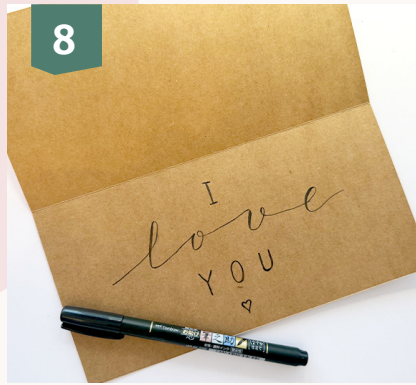
Finally, write a sweet message inside the card to finish it off!