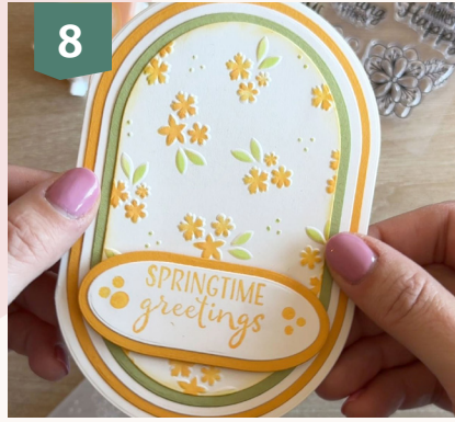
Assemble all the pieces, and your cheerful spring card is ready!