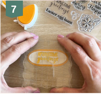
Stamp a fun message on the card using yellow ink.