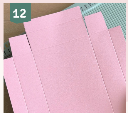
12 Cut into the 9.8 inches (25 cm) sides as shown in the photo.