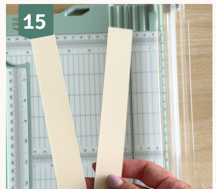
15 Cut 2 strips of cardstock measuring 1 x 11.8 inches (2.5 x 30 cm).