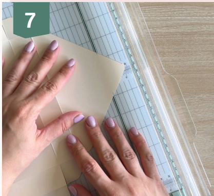
7 Draw a straight line between these marks and cut off the point.