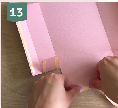
13 Crease all score lines firmly with a bone folder and apply double-sided tape to the inside of the flaps.