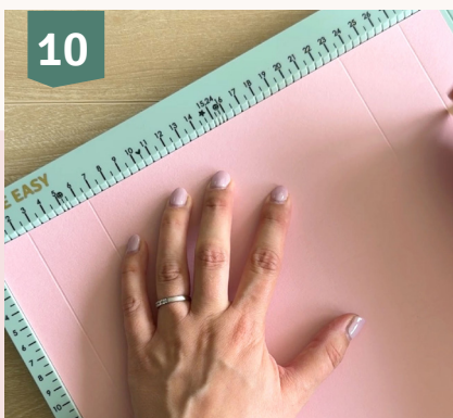
10 Place the 11.8 inches (30 cm) side at the top and score at 1 inch, 2.5 inches, 9.2 inches and 10.8 inches (2.5 cm, 6.5 cm, 23.5 cm and 27.5 cm).