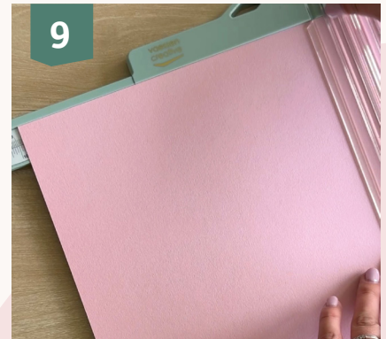
9 Cut one sheet of cardstock to 11.8 x 9.8 inches (30 x 25 cm). This will form the box to hold the envelope boxes.