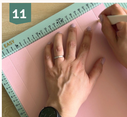
11 Rotate the paper a quarter turn (9.8 inches/25 cm side at the top) and score at 1 inch, 2.5 inches, 7.2 inches and 8.8 inches (2.5 cm, 6.5 cm, 18.5 cm and 22.5 cm). Draai het papier een kwartslag (25 cm boven) en ril op 2,5 cm, 6,5 cm, 18,5 cm en 22,5 cm.