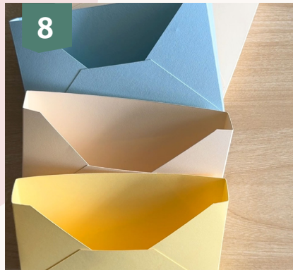
8 Assemble all envelope boxes using glue or double-sided tape.